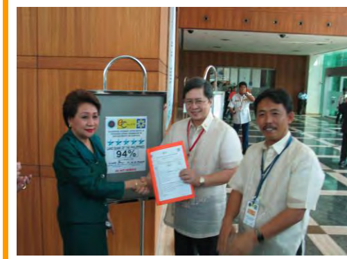
Posting of Agency Rating