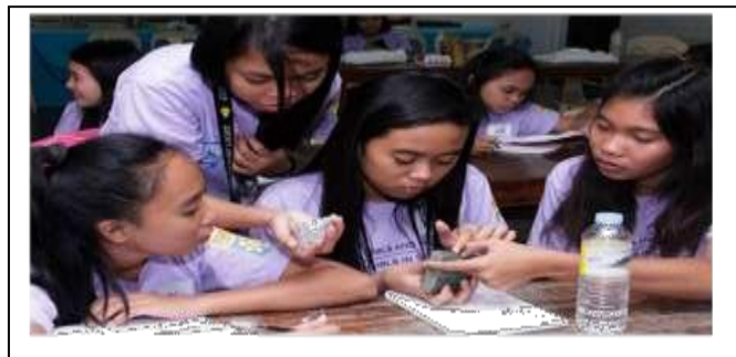
Girls and Science, Girls in Science

In 2011, the GAD-NFP launched another innovative project, “Girls and Science, Girls in Science,” which seeks to encourage third- and fourth-year high school girls from selected science schools to enroll in courses related to the geosciences, engineering, and related disciplines. In 2013, this project gained ground in some parts of the country, opening various opportunities for female students to pursue science courses. It could thus serve as a first step in increasing the future supply of female engineers, geologists, and the like.