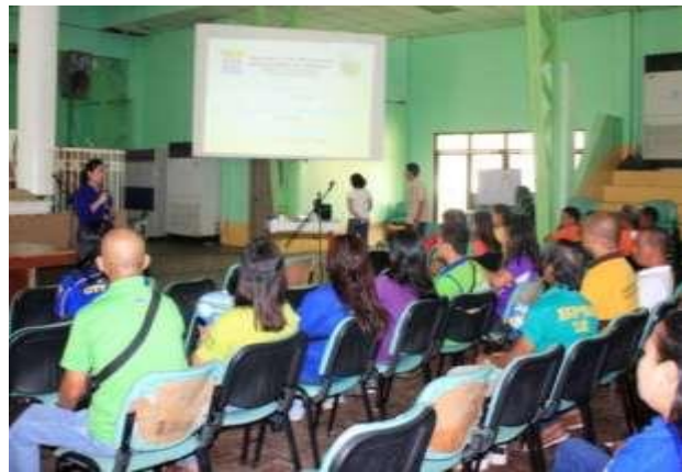
IEC on ESPEM

In addition to organization-oriented initiatives, GAD-NFP embarked on a series of client-focused programs. In 1998, it launched information, education and communication (IEC) campaigns on energy efficiency and conservation and on safety issues affecting women and men, but in different ways. Collectively known as “Energy Safety Practices & Efficiency Measures (ESPEM),” the campaigns had since gained public recognition, as these expanded beyond their initial focus on national agencies in the National Capital Region (NCR), to other line agencies, local government units, barangays, subdivisions and villages, schools, associations, and cooperatives nationwide. Through these, the DOE sought to dispel the public’s narrow view of its function – simple announcements of oil price increases and rollbacks – and introduced its broader mandate of ensuring energy security, optimal pricing, and sustainable energy systems.