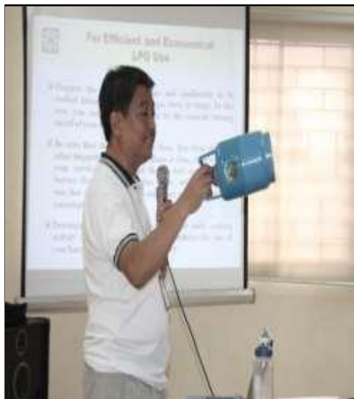
IEC on liquefied petroleum gas

In 2010, GAD-NFP aggressively pursued more information campaigns, including “Safe LPG and Bote-bote ,” which aims to disseminate information on safety practices in handling petroleum products, such as liquefied petroleum gas, or LPG (mainly used in cooking), and gasoline. Another initiative involves building the capacity of female mechanics through skills training in auto-LPG conversion. Added to these is support for the publication of The Compendium of Energy Laws and Issuances . This four-volume publication compiles energy-related regulations that are expected to benefit energy stakeholders, researchers, students, and other clientele of the Department. This, however, needs a companion piece that analyzes the laws and issuances as to their gender dimensions and effects.